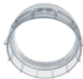
Cell Housing Nut