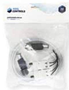
Double Valve Replacement Kit