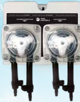
D10 Dual Pump 60RPM Product Code - 09061064