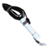
Multi-Electrode Assembly for Tapping Band with 3m cable