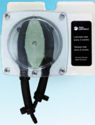
D1500 Peristaltic Pump Flow rate of 1500mL per minute. Product Code - 09061067