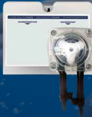
Pool Controls SG Series pH Control System Product Code - 00122021

Provides pH control in Salt or Mineral Pools via peristaltic pump.