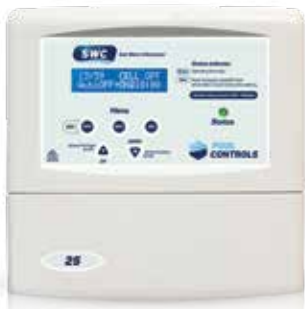
SWC Replacement POWER SUPPLY ONLY

All Power Supply units have been designed to operate in full sun and our tough Australian weather and Pool Controls anticipates that you will enjoy many years of trouble-free pool water management from your investment. However, like all equipment your machine will look better and last longer if it is well-maintained and operated in accordance with the instruction manual provided. Instruction manuals are also available to download from www.poolcontrols.com.au