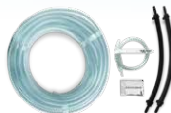
Dual Pump Commercial Tubing Maintenance Kit