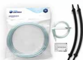
Dual Pump Tubing Maintenance Kit