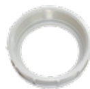
SG Cell Housing Nut