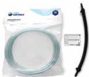
Single Pump Tubing Maintenance Kit

Choose from the Single Pump, Dual Pump and Commercial Tubing Maintenance Kits depending on your installation. Each Kit contains replacement squeeze tube (or tubes), sachet of silicone grease, 6m roll of feed tubing and for dual pump kits, a pre-assembled gas loop with connectors.