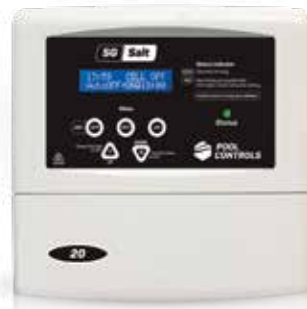
SG Series Replacement POWER SUPPLY ONLY