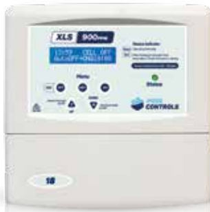
XLS Replacement POWER SUPPLY ONLY