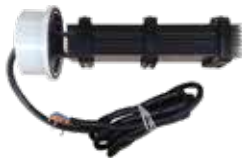
SG Cell Housing